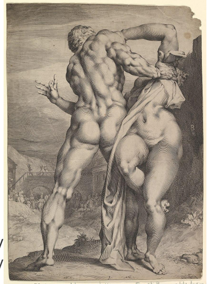
Adriaen de Vries, 'The Rape of the Sabine Women'

The scene begins with establishing Blanche as delusional and Stanley as the realist . An emotional battle precedes the rape, Stanley verbally destroys all of Blanche's delusions, this foreshadows his words turning physical. As Stanley represents the rising New America and Blanche represents the deteriorating Old South; the rape can be construed as symbolic for the defeat of the Old South. Stanley raping Blanche is an embodiment and assertion of his words "King around here".